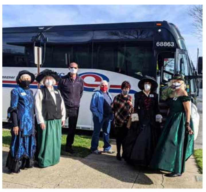
The number of passengers on each of our motorcoach groups this year was about half of what usually arrives. They were all very polite and enjoyed the National Museum of Cambridge Glass.