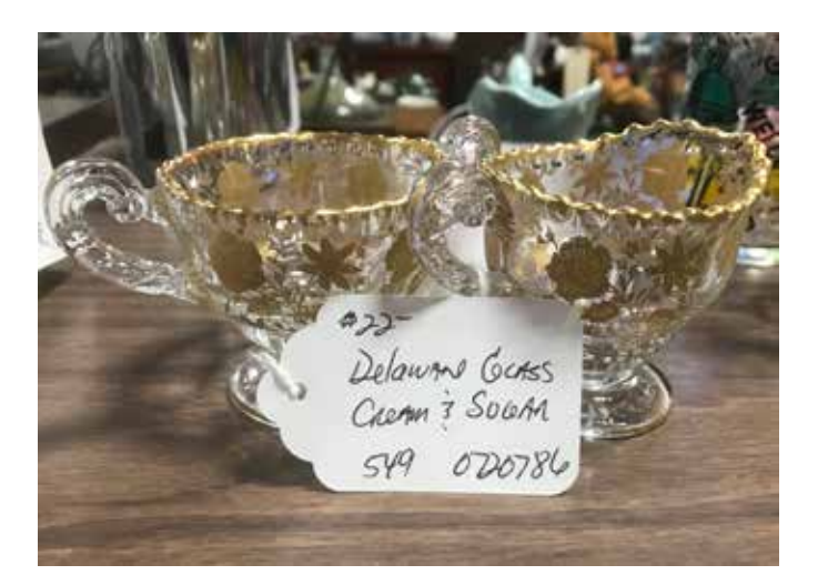
This "Delaware Glass" is nice stuff. Hope to find more of it!