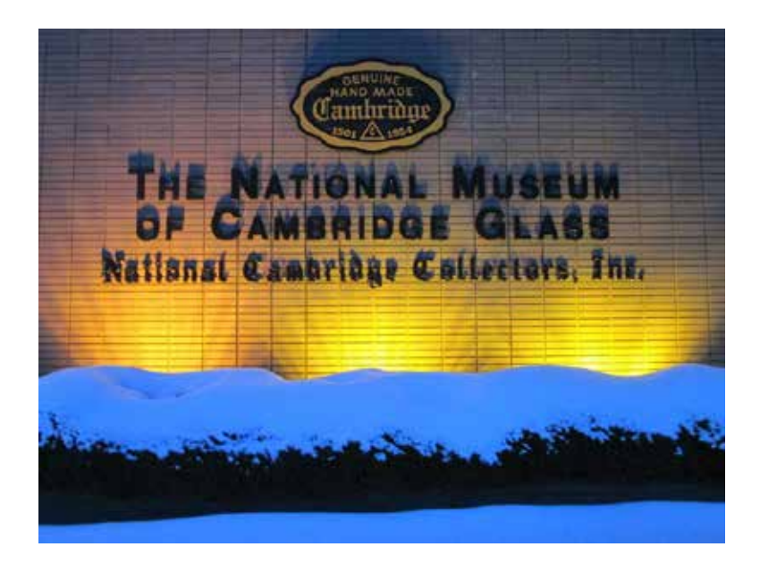
The National Museum of Cambridge Glass Open April thru October only