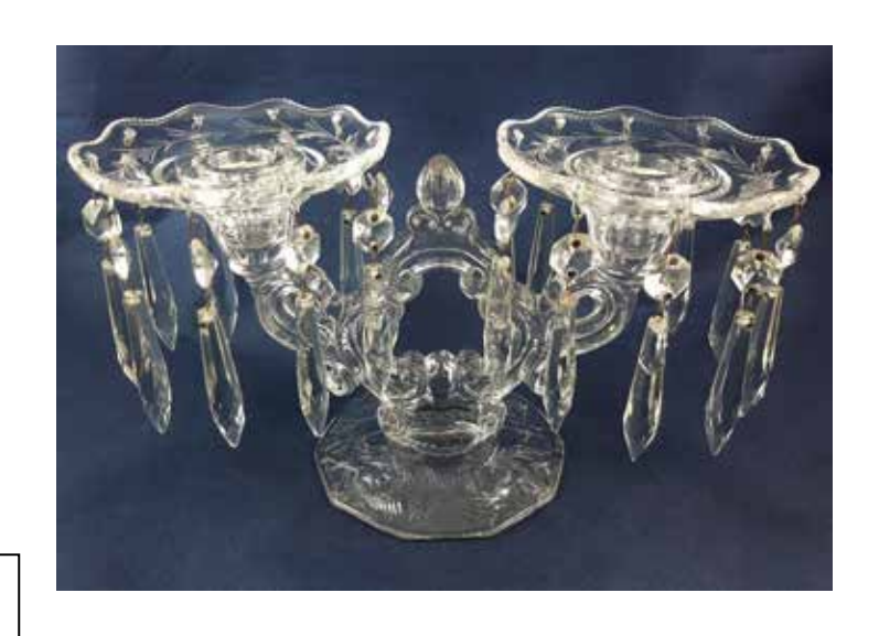
1268 - 6 ½ in. 2-Lite Candelabrum, RCE 560