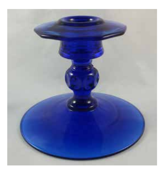
Version 1, Ritz Blue