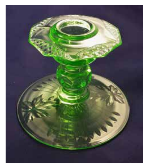
Version 1, Light Emerald, RCE 657