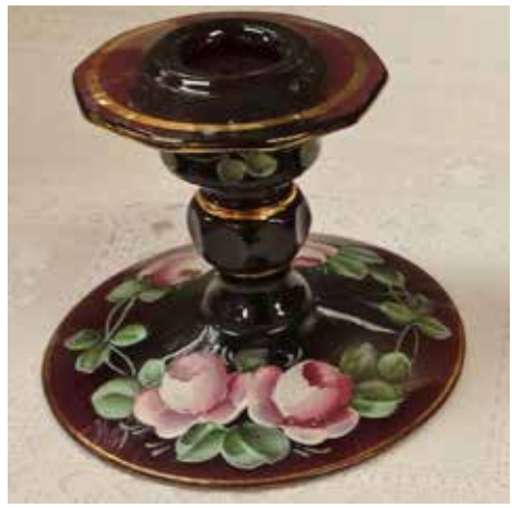
Version 1, Amethyst, Charleton Decor