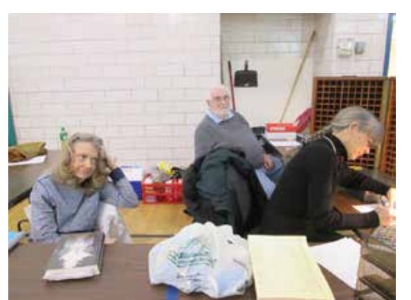
Some of the behind the scenes people who help make things run smoothly.