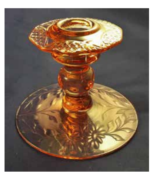
Version 1, Peach-Blo, RCE Unknown