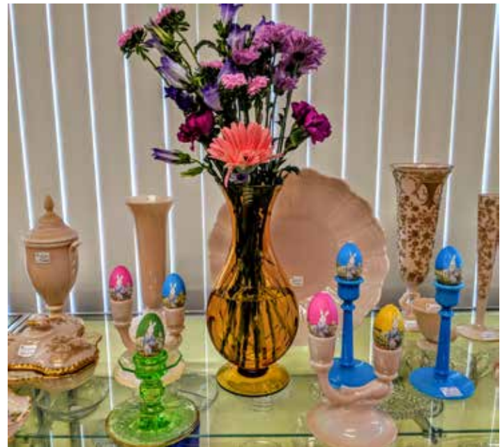
Karen Treier brought flowers to celebrate opening day!

Toni Chandler, Metamorphosis Productions, Inc. from the Cleveland/Akron area visited the museum for a site