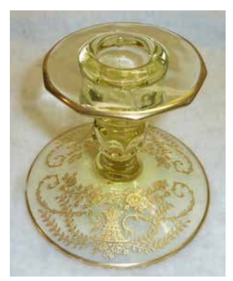
Version 1, Gold Krystol, Etched Portia, Gold Enc.