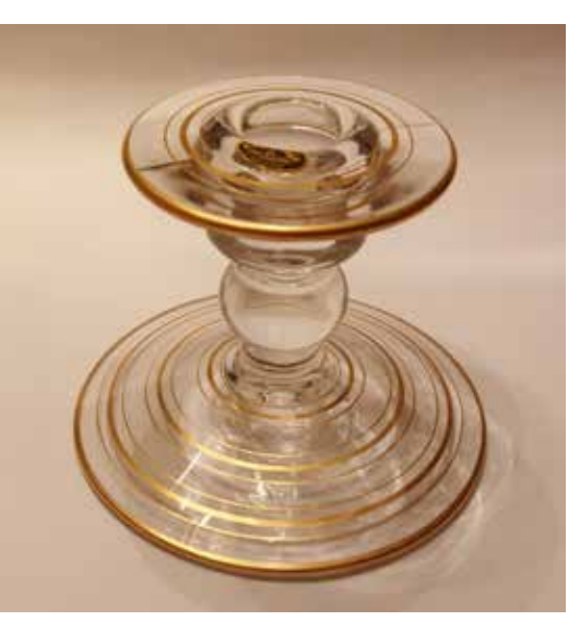
Version 4, D/1046 Gold Bands