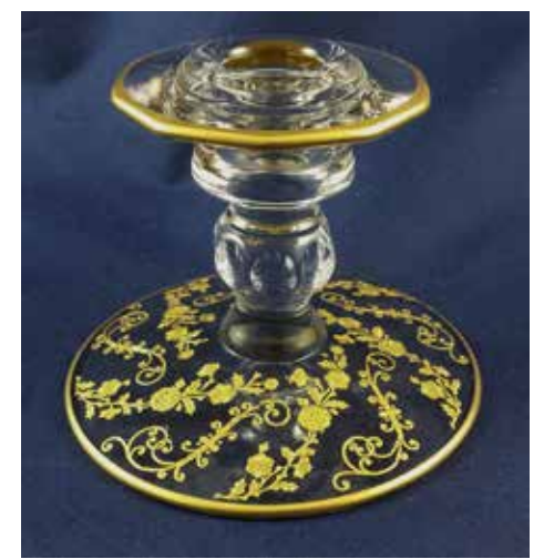
Version 1, Etched Elaine, Gold Encrusted

Final thought for you collectors: The colors and etches listed above as available were taken from the Cambridge price lists and circular letters and are all known to exist. The vast majority of the #627 blanks found are Version 1. Those listed above in Versions 2, 3 & 4 as well as others you may have or yet to be discovered should be considered difficult to find. And lastly, of all the items listed as available RCE, I only know of #541, #639 (not listed as available) and #657 as well as some that are unidentified. Given that they were listed as available in all these other patterns, you'd think some exist or would show up. So any examples RCE must also be considered hard to find.