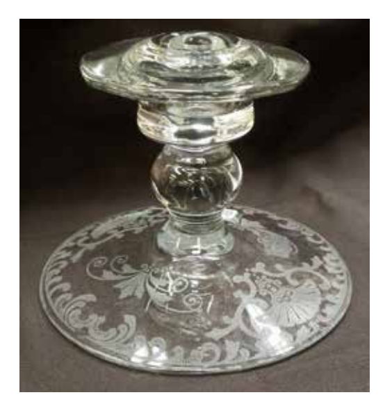
Version 3, Etched Firenze