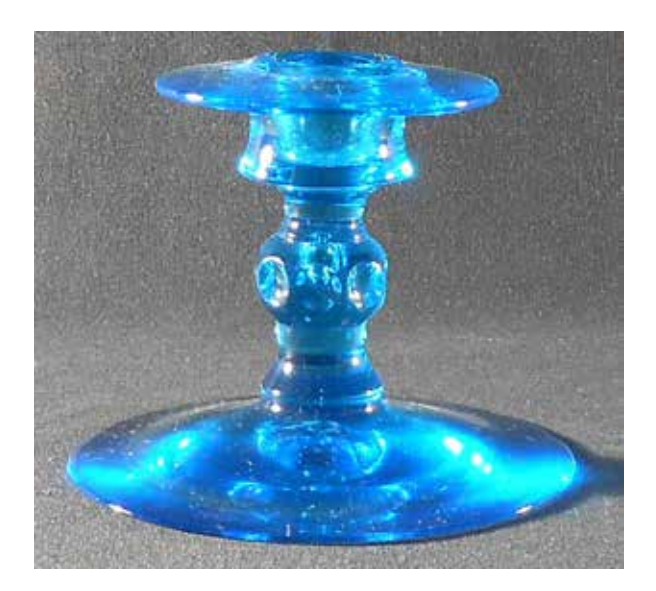
Version 2, Bluebell