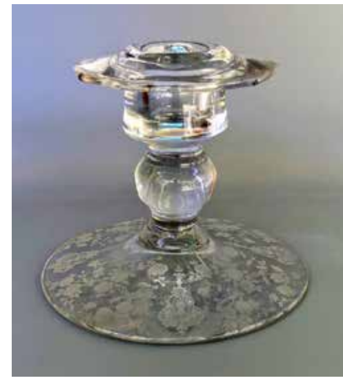
Version 3, Etched Rose Point