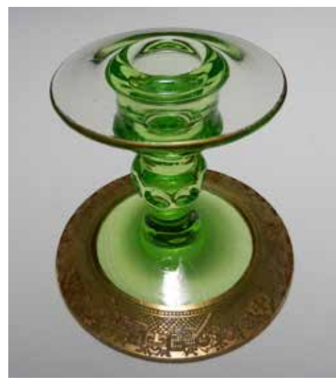
Version 2, Light Emerald, Etched Willow, Gold Band Overlay