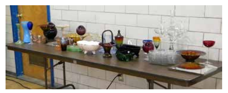
Some of the items won by successful Absentee Bidders. Your's could be here next year!