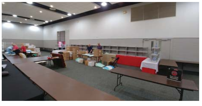
Where will you be June 26-29, 2019?