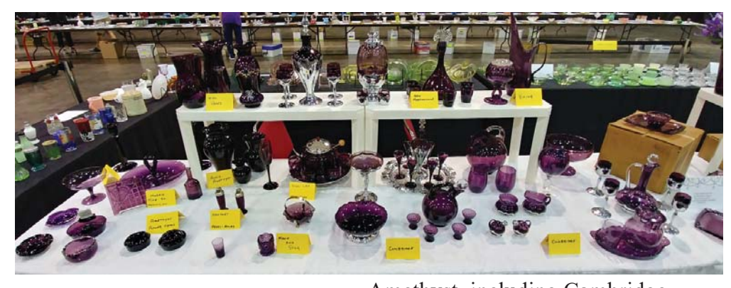
Amethyst, including Cambridge