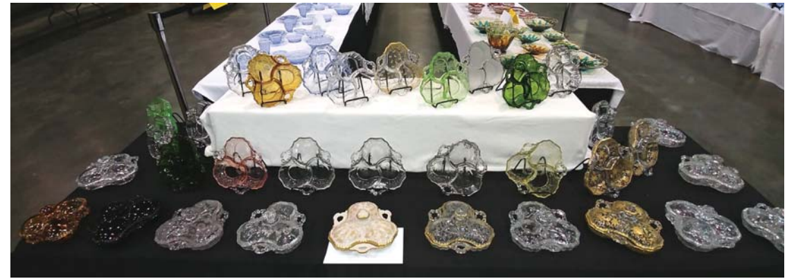
Check out the covered candy boxes and 3-part relishes