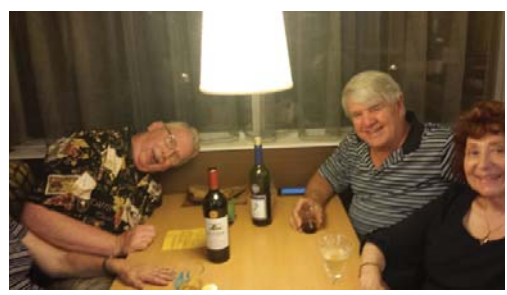
Everyone gets tired at the end of the day.