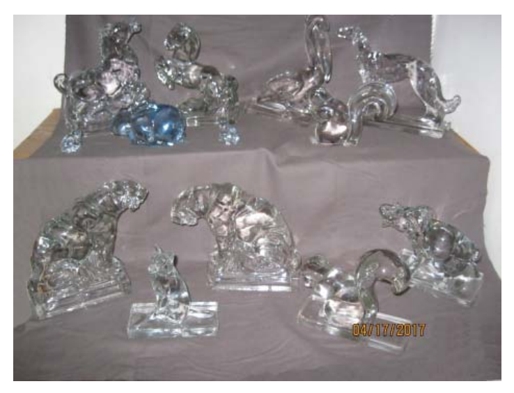
All items are New Martinsville; items with a rectangular base are bookends Top back row: Horse Head-Up, Carriage Horse, #761 Pelican, #16 Wolfhound

Top front row: #764 Mama Rabbit, two #765 Bunny, Head Up, Ears Back (all experimental blue), #674 Squirrel (without a base) Bottom row: Tiger Head Up, #733 Police Dog, Tiger Head Down, #670 Squirrel, #237 Elephant