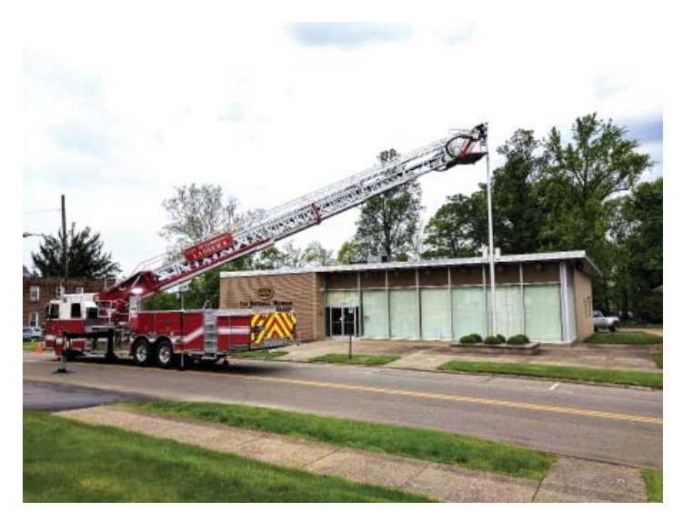
Many thanks to the City of Cambridge Fire Department for fixing the museum flagpole. What nice neighbors!

The next day they arrived with their ladder truck, blocked off the street and went to work. They were able to retrieve the old flag and install a new nylon rope. The men said that the reason we were not able to get the flag down was because the rope at the top of the pole on the pulley was worn and also ready to break. We can't thank them enough for their support. A thank you card and goodies from Kennedy's Bakery were delivered to