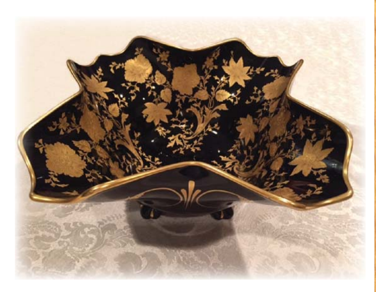
3400/45 11 in 4-toed Fancy Edge Bowl D/1047 Gold Encrusted Wildflower (Ebony)