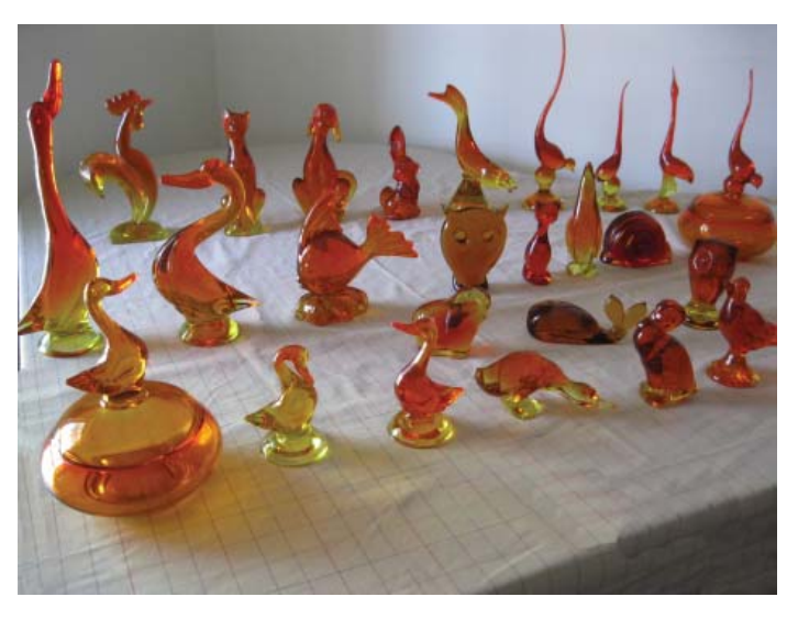
All items are Viking Glass Co. persimmon except as noted (most are of the Epic series) except the Blenko Glass Co.also noted Back row:: #1321 rooster, #1322 cat, #1323 dog, #6808 rabbit, #1320 fish on a base, #1310 long tailed bird, #1311 long tailed bird, #1315 egret

Enjoy this preview of what you might see on display at this year's convention. From the collection of Grant and Dolores Giesler