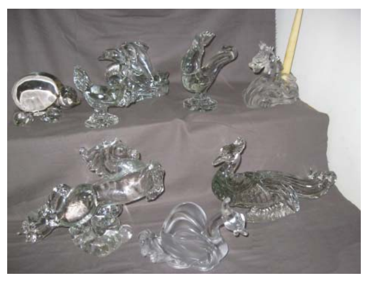
Top row all New Martinsville except Imperial Dragon Top row: #762 Mama Pig, two #763 Piglets, #669 Hen, #766 Porpoise On A Wave, #668 Rooster, Imperial #5009 Cathay Dragon (candlestick holder) Bottom row: Heisey Flying Mare, Imperial Cathay Phoenix

Bottom front row: Fenton #5131 Walking Elephant (amberina), Cambridge #70 Seashell Turtle - domes