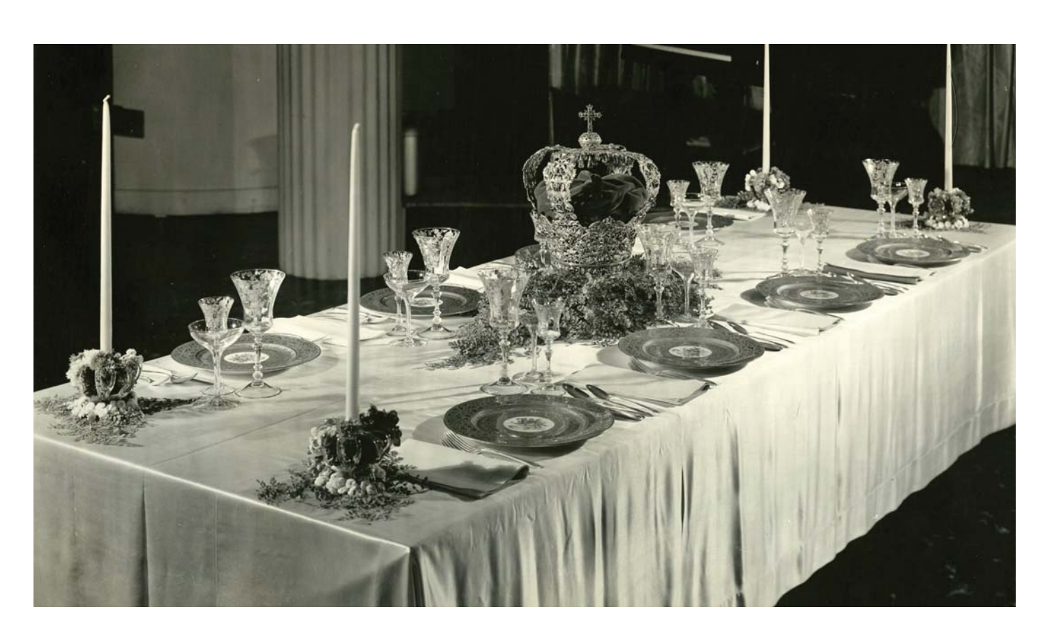
Can you imagine what these pictures would have looked like in color?