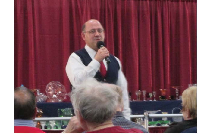
Show & Tell