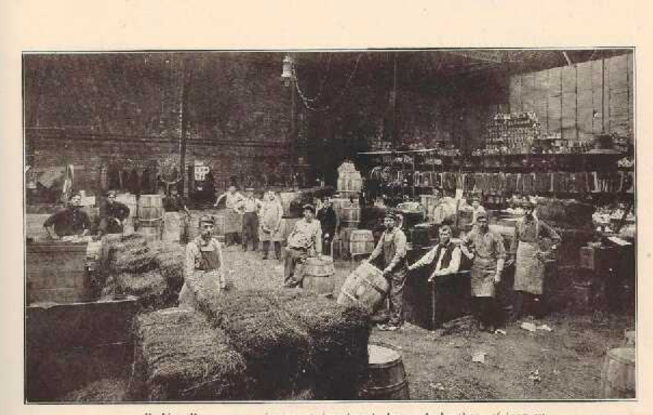
Packing Room, a very important department, done only by those of long experience. Very few breakage complaints are received, which testifies to their ability.

"This photo is the Packing Department at the Cambridge Glass Company in the early years. They used straw to pack the glassware in wooden barrels that they made at the glasshouse. It would then be shipped by train to stores all over the country!"